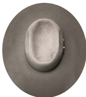
Bull Rider Crown