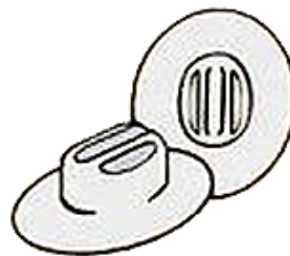
Hat with a shaped crown